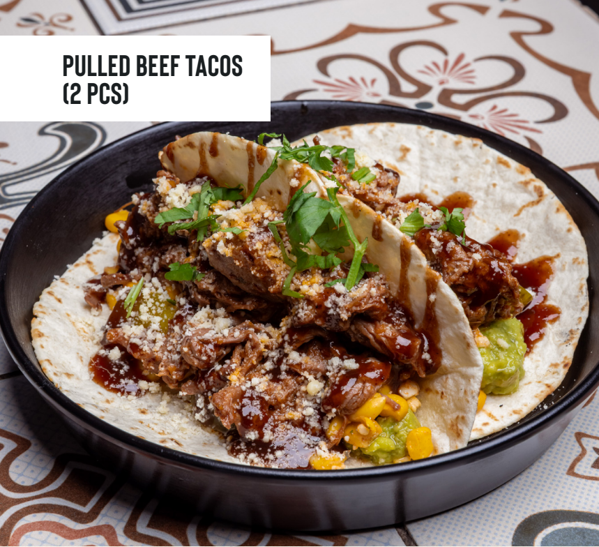
PULLED BEEF TACOS (2 PCS)