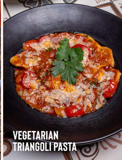
VEGETARIAN TRIANGOLI PASTA

Pumpkin, ricotta and walnut stuffed pasta cooked with onion, garlic, hint of chilli, spinach and napolitana sauce with shaved parmesan + chicken $6 | + prawns $7.5