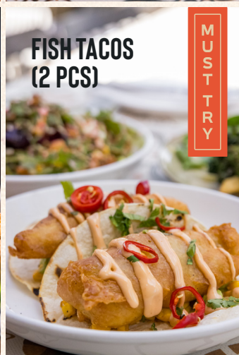
FISH TACOS (2 PCS)