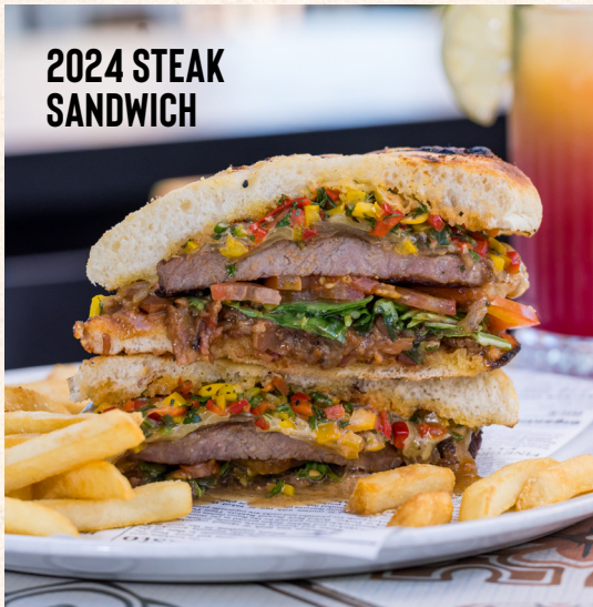
2024 STEAK SANDWICH