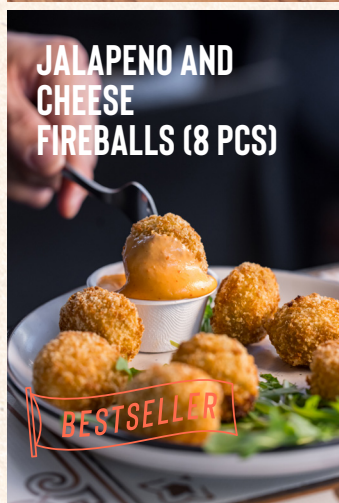
JALAPENO AND CHEESE FIREBALLS (8 PCS)