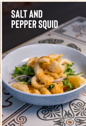
SALT AND PEPPER SQUID