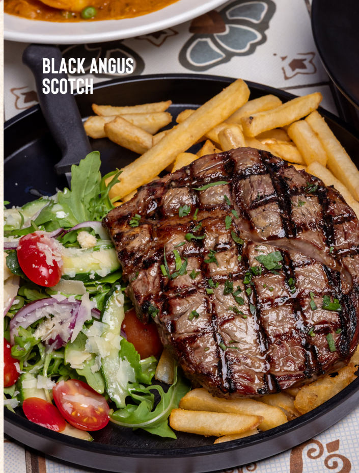
BLACK ANGUS SCOTCH