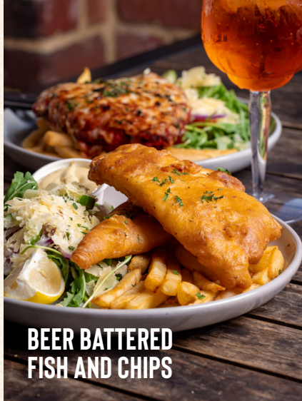
BEER BATTERED FISH AND CHIPS

Two pieces of freshly fried snapper fillets served with chips, tartare sauce and side salad of cucumber, cherry tomato, red onion, shaved parmesan, rocket and vinaigrette dressing