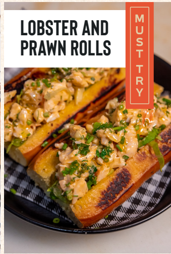
LOBSTER AND PRAWN ROLLS