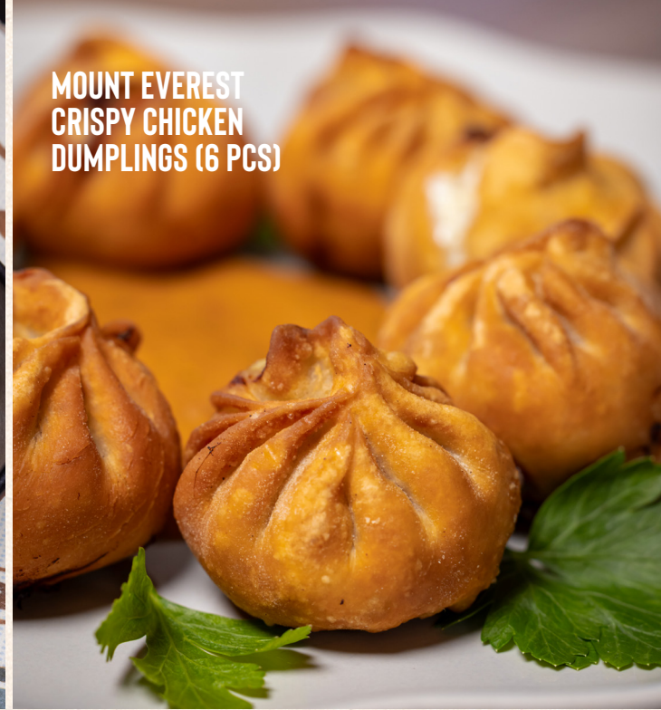
MOUNT EVEREST CRISPY CHICKEN DUMPLINGS (6 PCS)