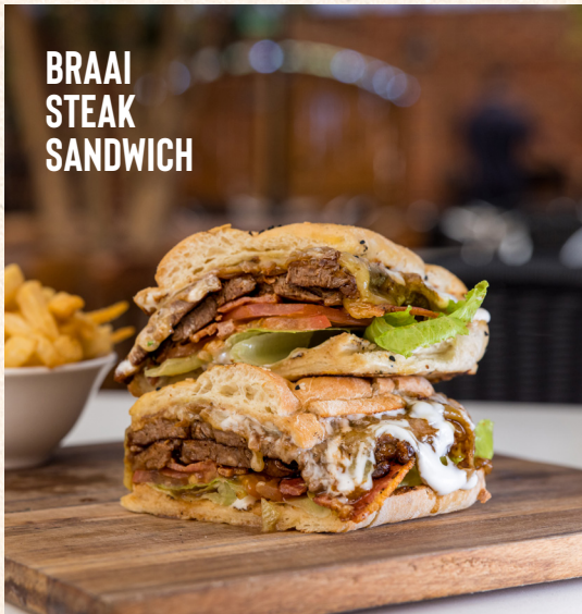
BRAAI STEAK SANDWICH