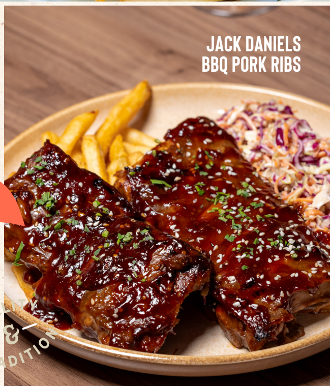
JACK DANIELS BBQ PORK RIBS

Made with Jack Daniels Bourbon, BBQ glazed pork ribs served with chips and slaw