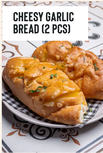
CHEESY GARLIC BREAD (2 PCS)

PLEASE PLACE THE ORDER FOR YOUR TABLE AT THE COUNTER