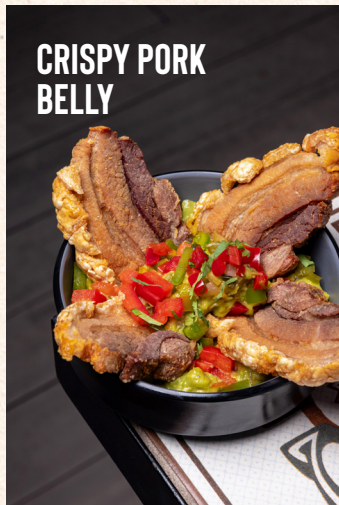
CRISPY PORK BELLY