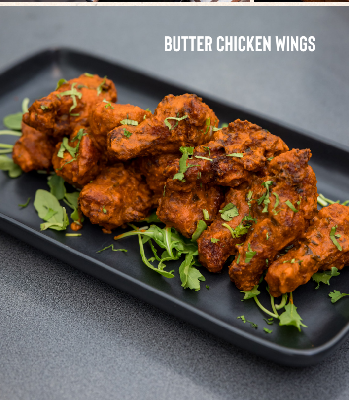
BUTTER CHICKEN WINGS