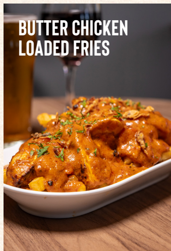
BUTTER CHICKEN LOADED FRIES