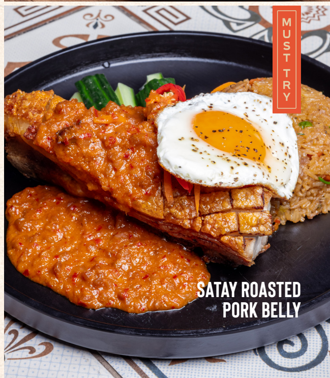
SATAY ROASTED PORK BELLY