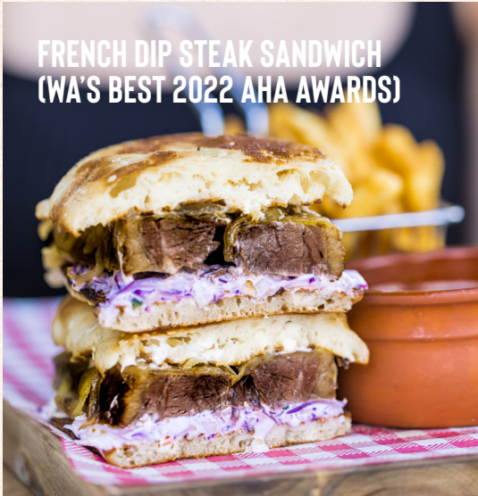
FRENCH DIP STEAK SANDWICH (WA'S BEST 2022 AHA AWARDS)