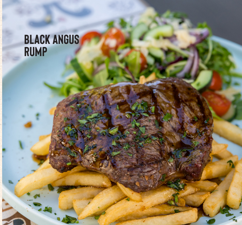
BLACK ANGUS RUMP