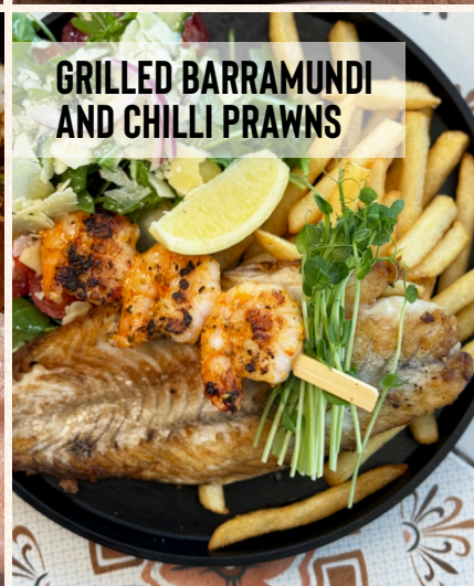
GRILLED BARRAMUNDI AND CHILLI PRAWNS