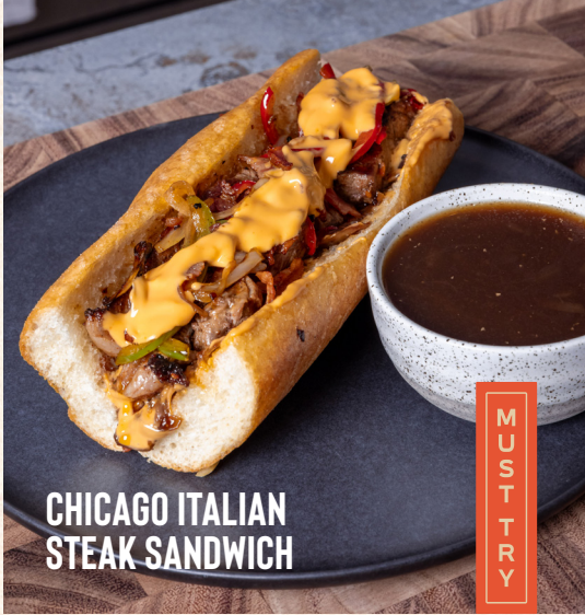
CHICAGO ITALIAN STEAK SANDWICH

Marinated grilled chicken, rocket, onion, feta, cherry tomato, macadamia nuts, caramelised pear, mixed with honey mustard vinegar